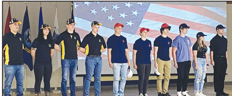
The Rite of Passage Ceremony took place in Conneaut on May 11, 2022.

The Commission is still actively looking for new Volunteer Drivers for our Transportation Program. There is no requirement to be a veteran to perform