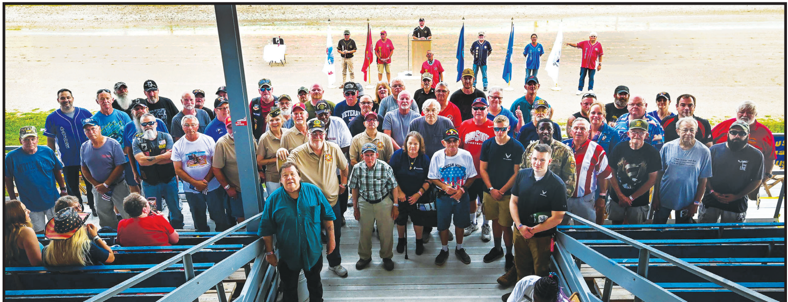
Last year's Veteran's Promise Ceremony at the Ashtabula County Fair.